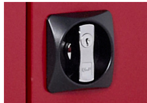
2-Point locking system