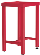
Optional stands available